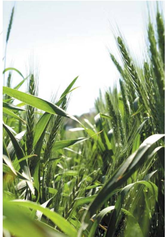
New vigorous wheat varieties can suppress weeds without chemical or mechanical management.

By measuring aspects of wheat and weed growth, researchers found plants that produced greater leaf area faster intercepted more sunlight to shade out weeds. If greater leaf area could be achieved from seedling emergence, then the wheat crop slowed weed growth and maintained more vigorous growth throughout the season.