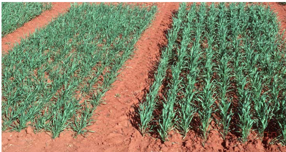
Commercial lines (left) and high-vigour wheat.

Research is supported by funding from the Grains Research and Development Corporation. Graingene ® is a joint venture between CSIRO, GRDC, AWB ® and Syngenta ® .